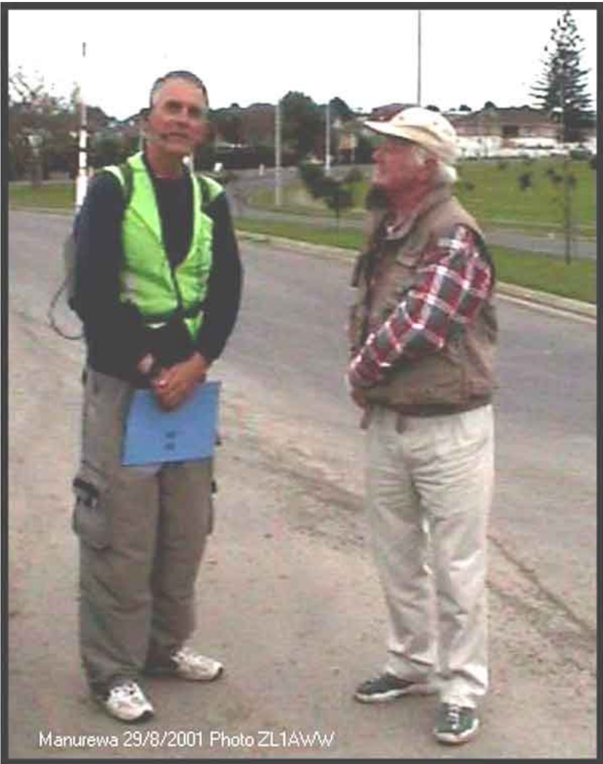
Manurewa 29/8/2001