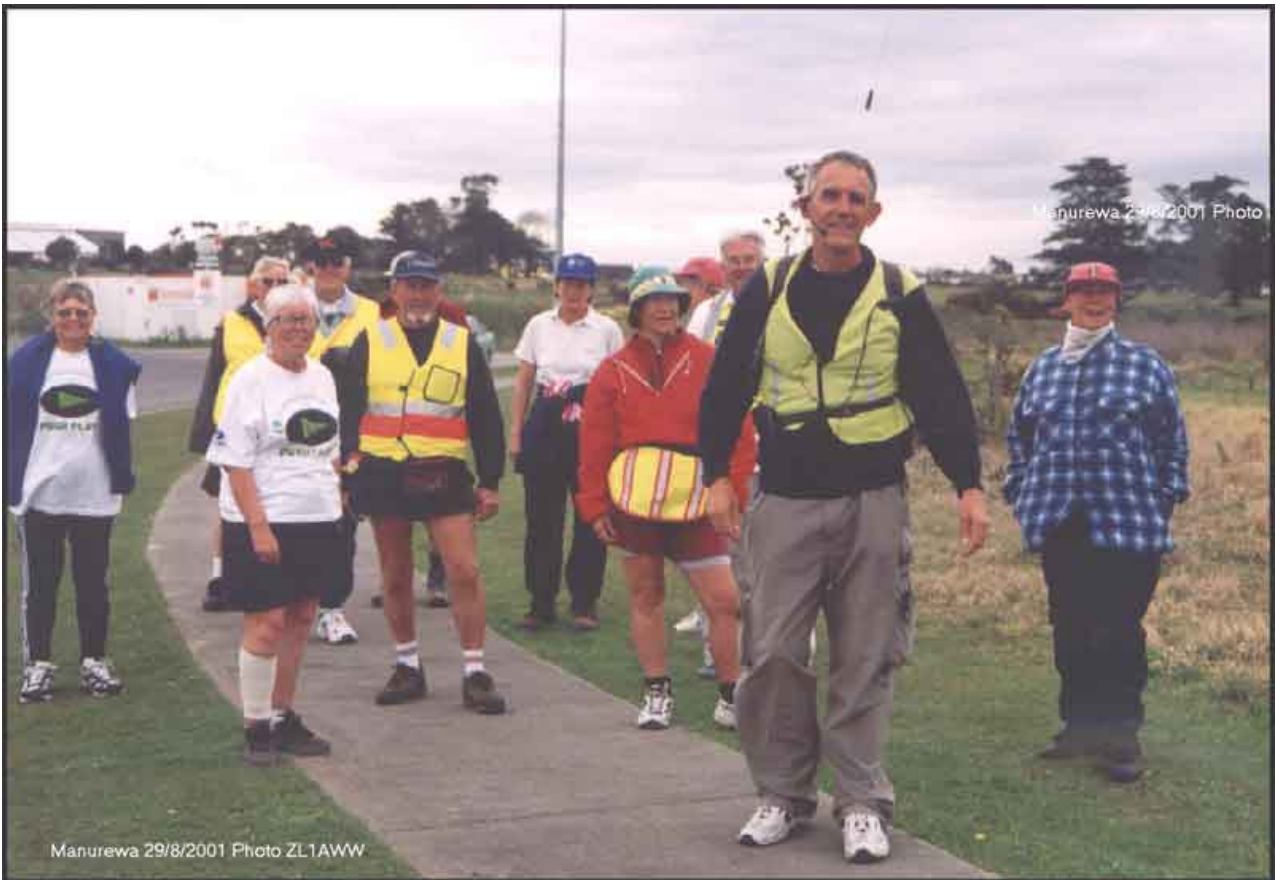
Manurewa 29/8/2001 Photo